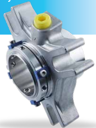
Universal applicable for packings conversions, for retrofits or original equipment: Cartex single seal

Some years ago, the customer and EagleBurgmann signed a "TotalSealCare" contract and started to convert all pumps from component seals to "Cartex" seals, i.e. cartridge single and doubles seals. Principally Cartex single seals are installed on the pump shafts to prevent egress of the process fluids. These mechanical seals are completely pre-assembled and precisely positioned component seals with cover plate and shaft sleeve. The cartridge design allows for quick and easy installation and makes it difficult for dirt to enter during assembly. Construction of this seal complies with the