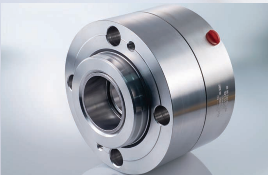
The SHVI single seal from EagleBurgmann is specifically designed for high pressures and speeds.

Plan 66A, which has been available since introduction of API 682 4th Edition, was the obvious choice for the safety concept. Accordingly, the seal housing contains two throttles, and the seal chamber is connected to a pressure transmitter.