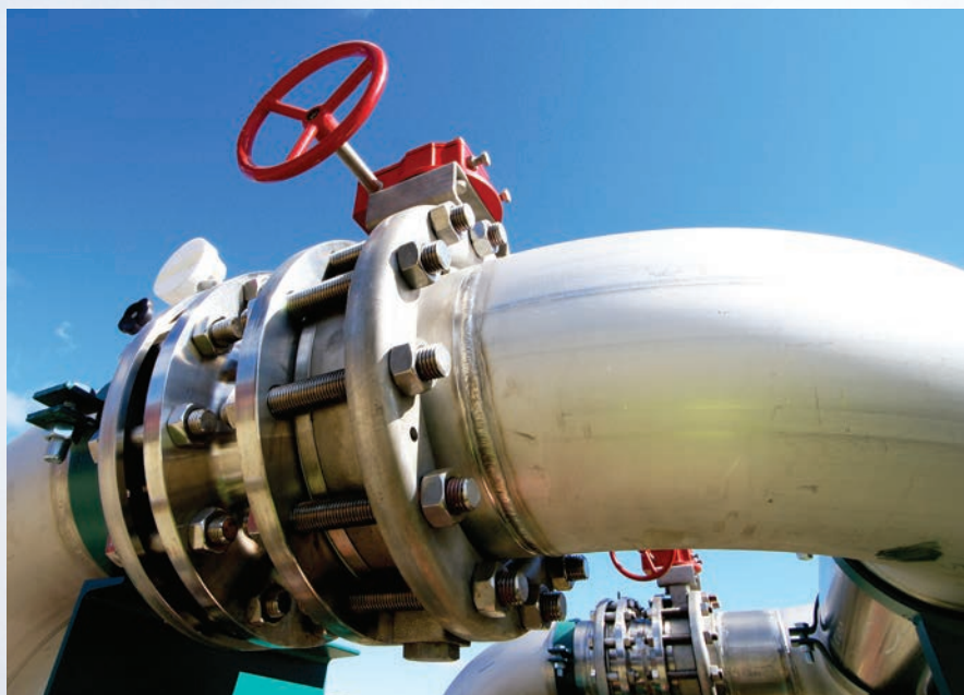
EagleBurgmann develops custom tailored sealing solutions for pipelines.

These requirements were best met by the SHV series which has proven itself thousands of times over in crude oil pumps and MOL pumps